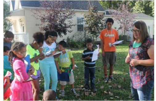
4Hers record their data after launching a rocket

The mission of 4-H Tech Wizards capitalizes on emerging technology as a way of involving youth and their families in learning about technology and science to reinforce college and career readiness for youth in the Indianapolis community.